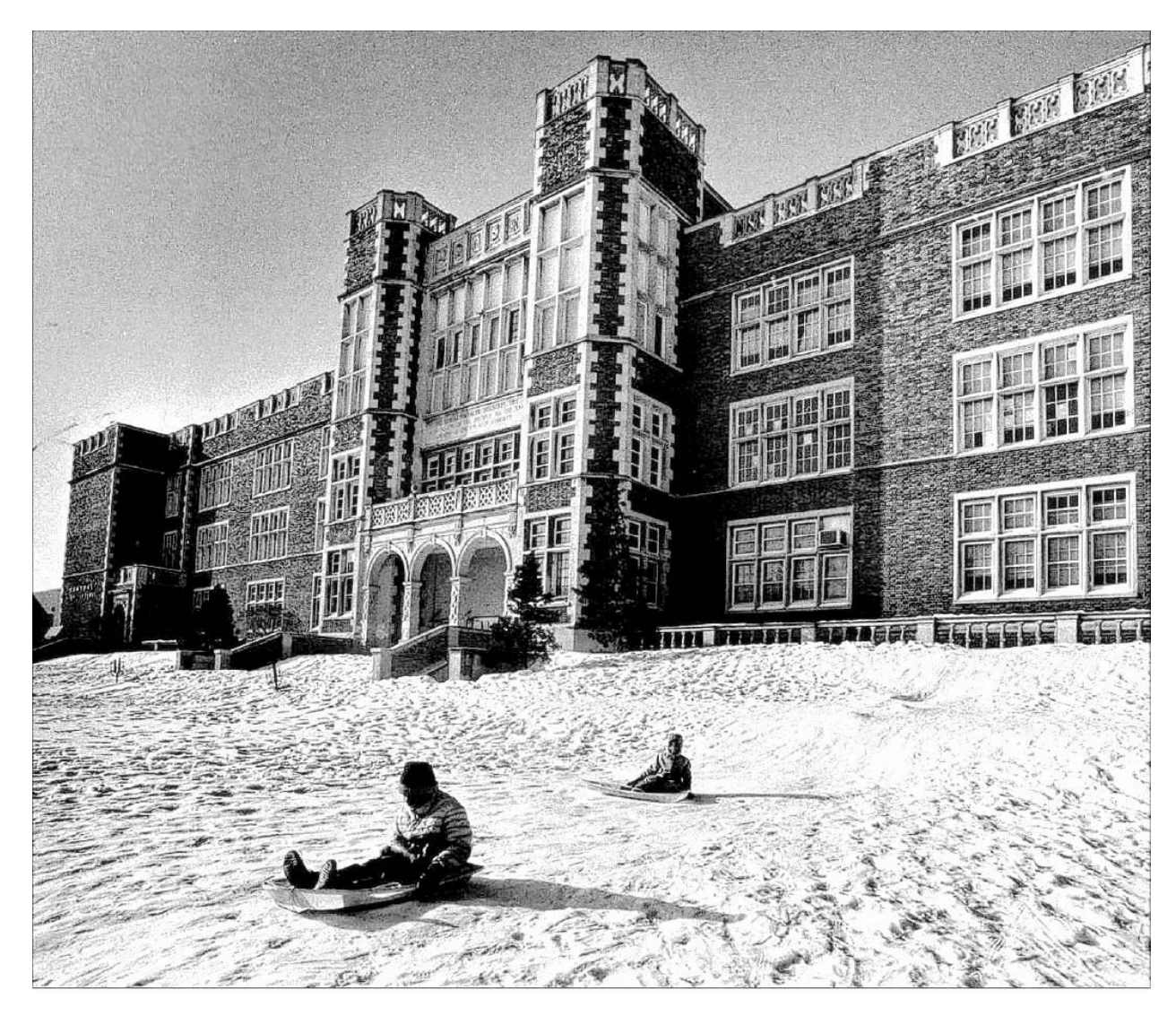
August 10, 2013 Central Park Gym and Richard Green Elementary School 11:00 a.m. to 2:30 p.m.