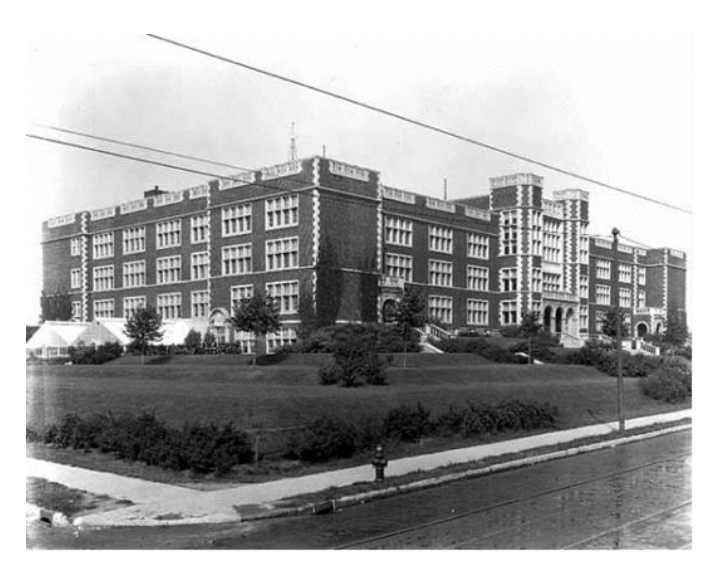
CHS in 1913. Note the streetcar lines.