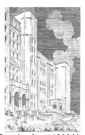
Student Drawing from 1923 Yearbook