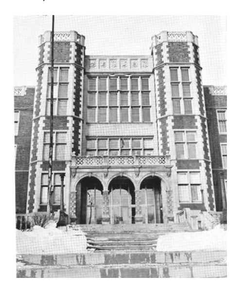
CHS in winter, about 1961