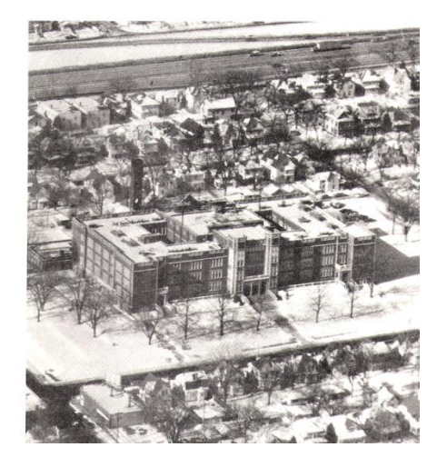
In Winter, after 35W is constructed