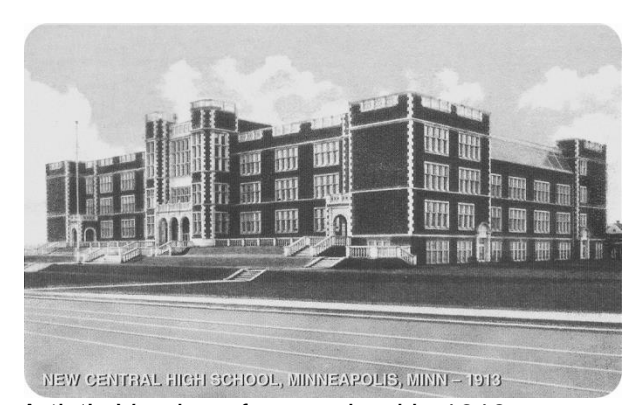
Artist's Version of new school in 1913